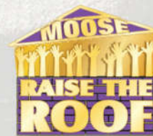
Moose Legion Pin