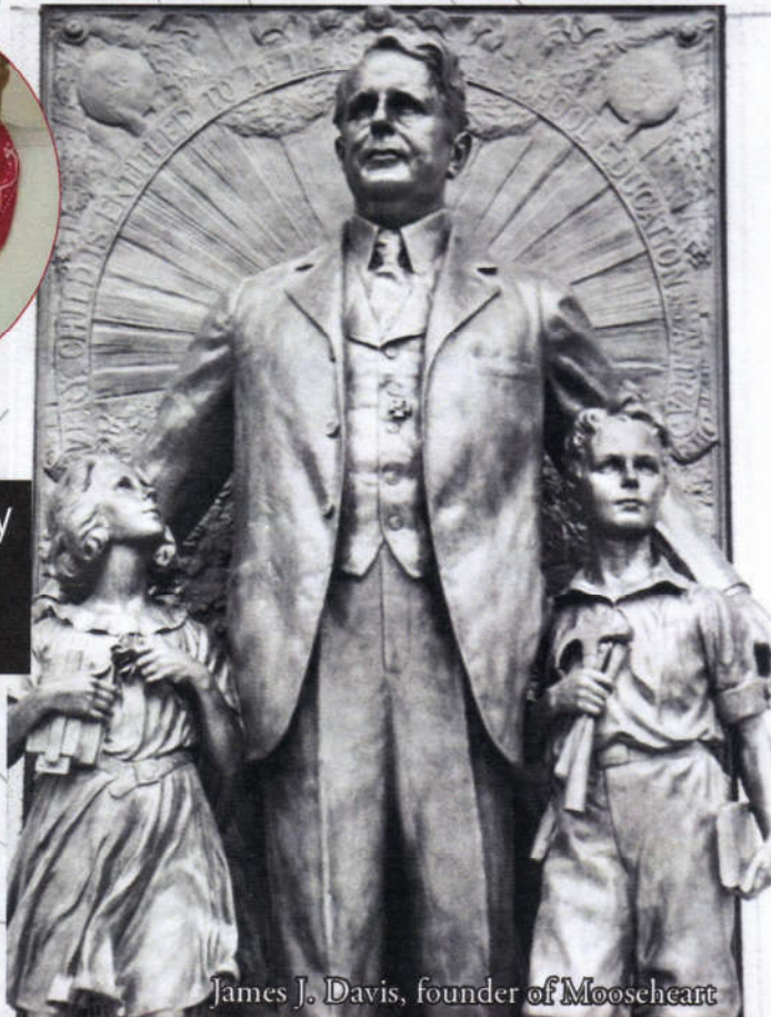
James J. Davis, founder of Mooseheart

Please wear your Donors Circle pin proudly and share the story of Mooseheart & Moosehaven at every opportunity.