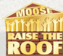
Lodge & Chapter Pin

"Moose – Raise the Roof" lapel pins are presented by your Lodge, Chapter or Moose Legion to members that sponsor their first member during this campaign.